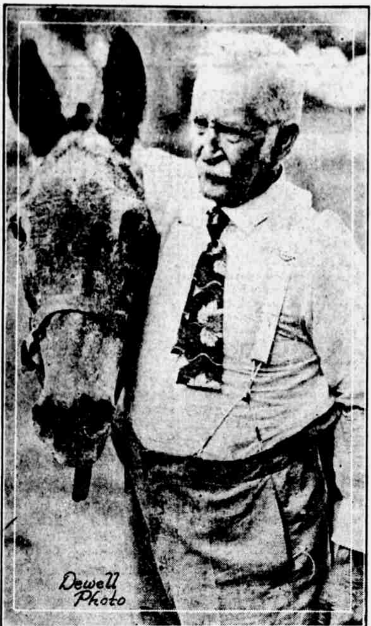
"Jennie" is the oldest mule in captivity.

She isn't always in captivity, however, for although she's lived for 44 years she still insists in running away every day or so.