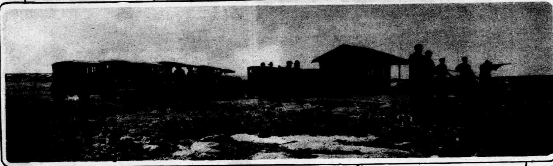
On the firing line at the trapshooting grounds of the Sidney Country club. The club also is proud of its attractive golf course.