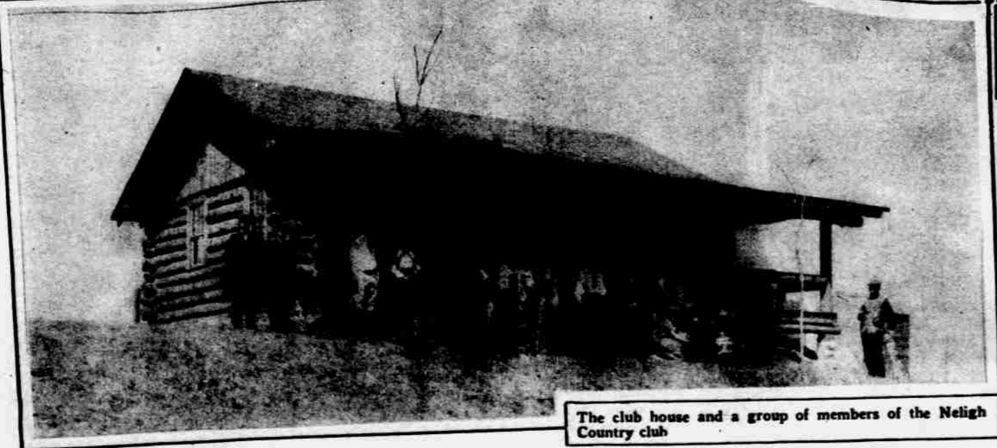
The club house and a group of members of the Neligh Country club.