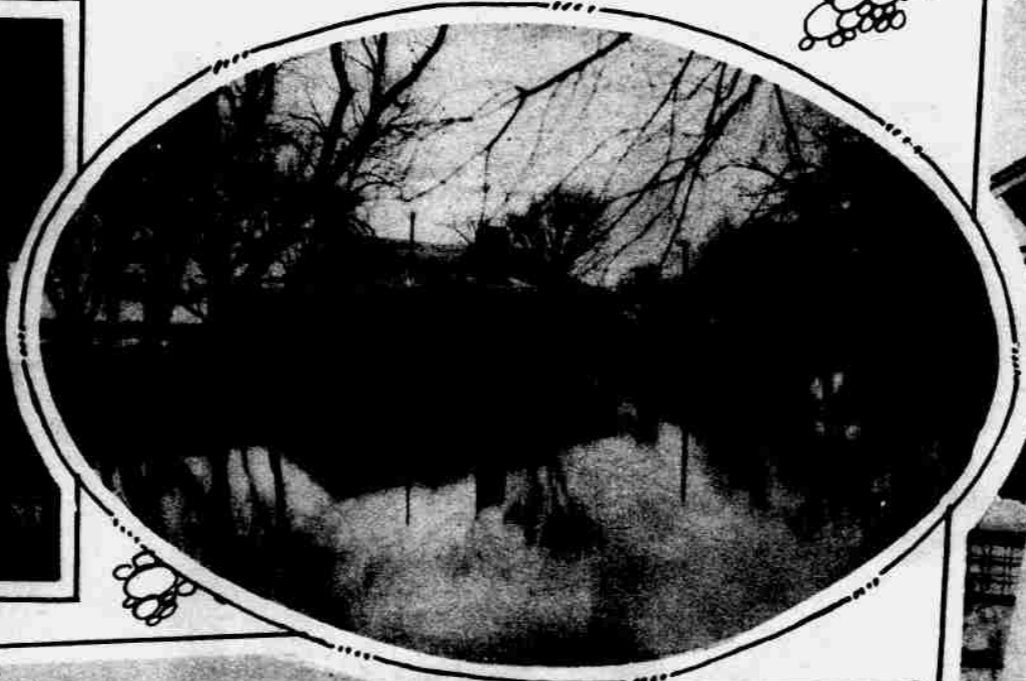
Members of the Woodland Park Golf club, Grand Island, selected an attractive setting for their club house.