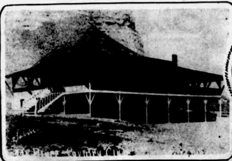
The roomy club house and golf course of the Scottsbluff Country club are at the base of the rugged bluff from which the city takes its name.