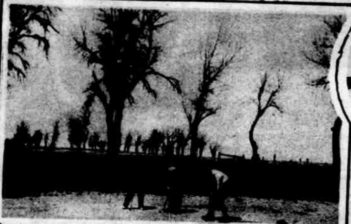
At the first green, O'Neill Country club.