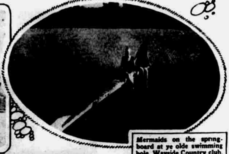
Mermaids on the spring-board at an old swimming hole, Wayside Country club, Columbus. The fairway of No. 9 on the golf course is seen in the background.