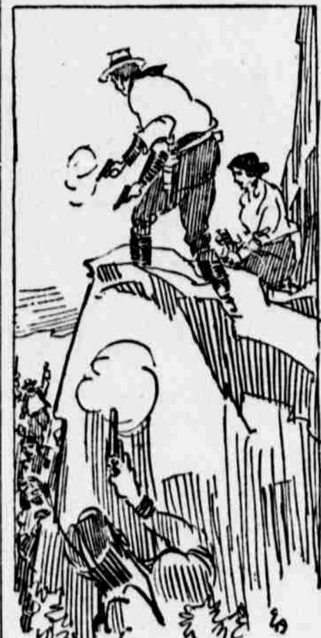
The Fellow Flung Up Both Hands.

back, reversed the gun in his hand, and struck with the butt at the first Indian appearing above the platform. It was hand to hand. "Tom!" "Yes." "I—I don't know what is going to happen. I—I am not afraid, but—but it seems to me I—I would like to have you kiss me once more first—you only have once, you know." Shelby turned his body about, leaving his cocked revolver lying on the stone, and caught both her hands eagerly. "Lord, I'm glad to hear you say that, little girl," he exclaimed, his eyes aglow. "I reckon I've been sorter