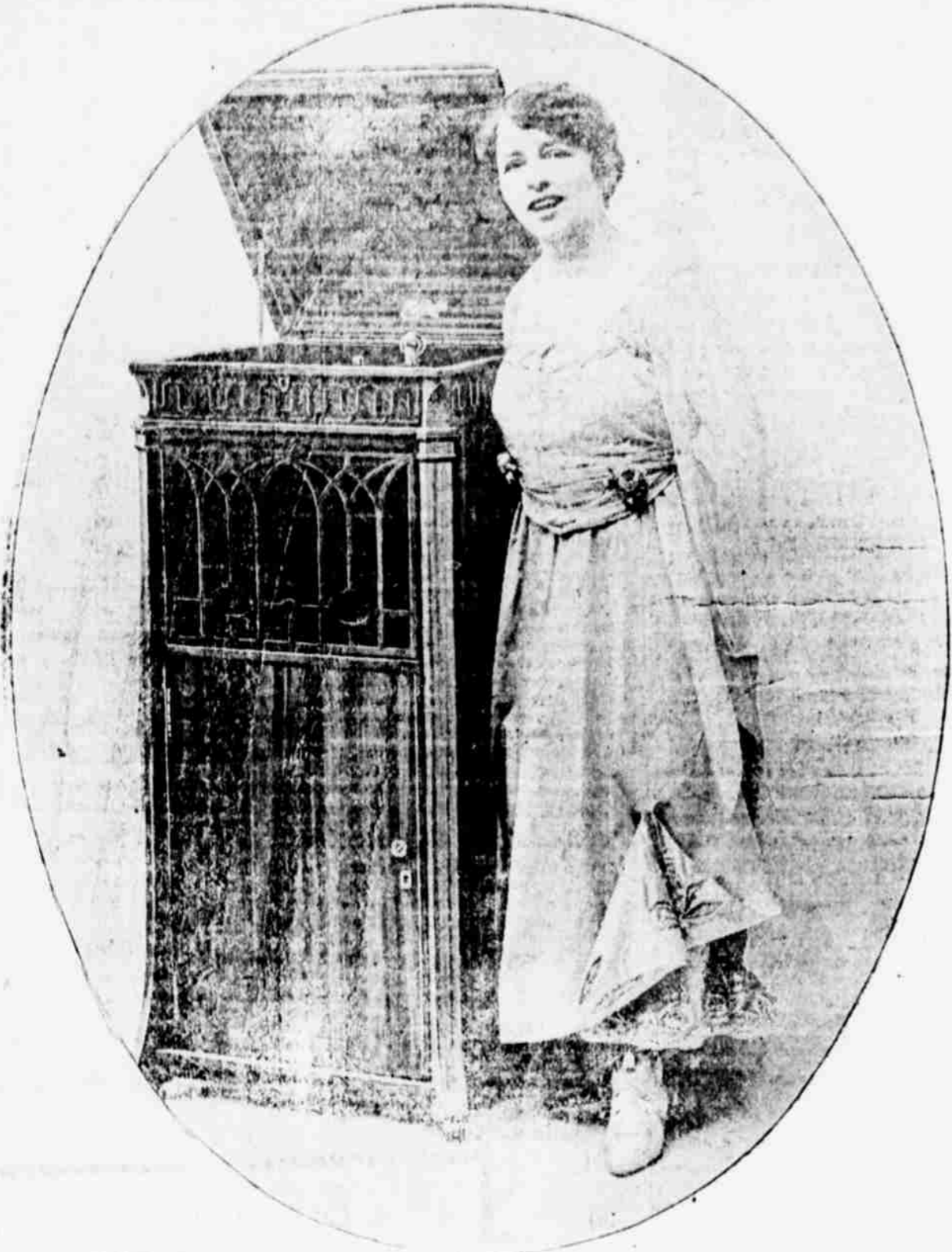
CHRISTINE MILLER, the famous American contralto, proving by personal comparison that Edison's Re-Creation of her entrancing voice cannot be distinguished from the original.

Is the only instrument ever invented that actually Re-Creates the human voice and the sounds of human-played instruments