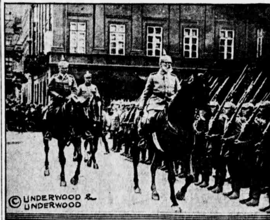
First picture received of the German occupation of Warsaw, showing Prince Leopold of Bavaria riding at the head of his staff along one of the principal streets of the old Polish capital which his army had captured.