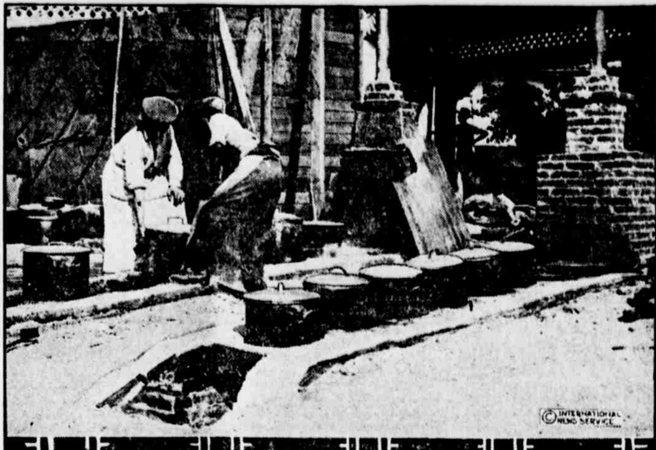
Army cooks preparing food in the British hospital at Luna Park, Heliopolis, near Cairo. Luna Park is an amusement place that has been taken over for the use of wounded soldiers, most of whom are Australians.