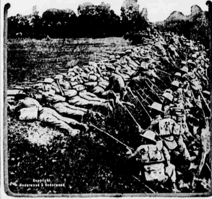
Detachment of Bersaglieri, the crack infantry of the Italian army, battling at the outskirts of a forest in the Carso region. They had been hidden in the thickets seen at the back of the picture and, upon the approach of the Austrians, came out to meet them.