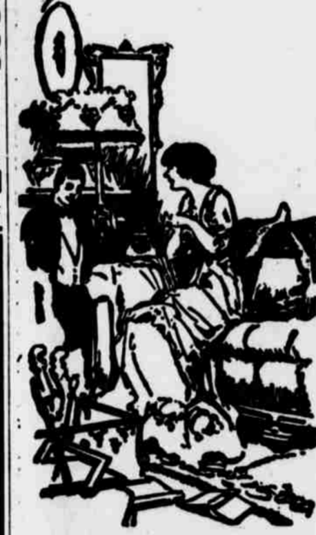
"She's a Dandy Girl."

"She is better than just pretty," ex- plained the young man. "Because there is intelligence in her face and