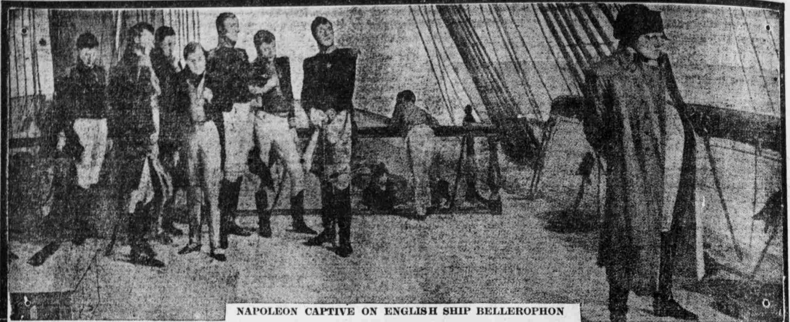
NAPOLEON CAPTIVE ON ENGLISH SHIP BELLEROPHON

NAPOLEON'S name fills more pages in the world's solemn history than that of any other mortal. This famous painting shows him a captive, on board the English ship Bellerophon, gazing out across the solemn sea toward France, where he was once Emperor. He realizes that his dream of Universal Empire is at an end, yet is unconscious that he is soon to be banished like an outcast a thousand miles from shore to the lonely and barren rocks of St. Helena. This famous picture from Ridpath's History illustrates but one event out of thousands which make up the history of every empire, kingdom, principality and power, all accurately and entertainingly told in the world-famed publication,