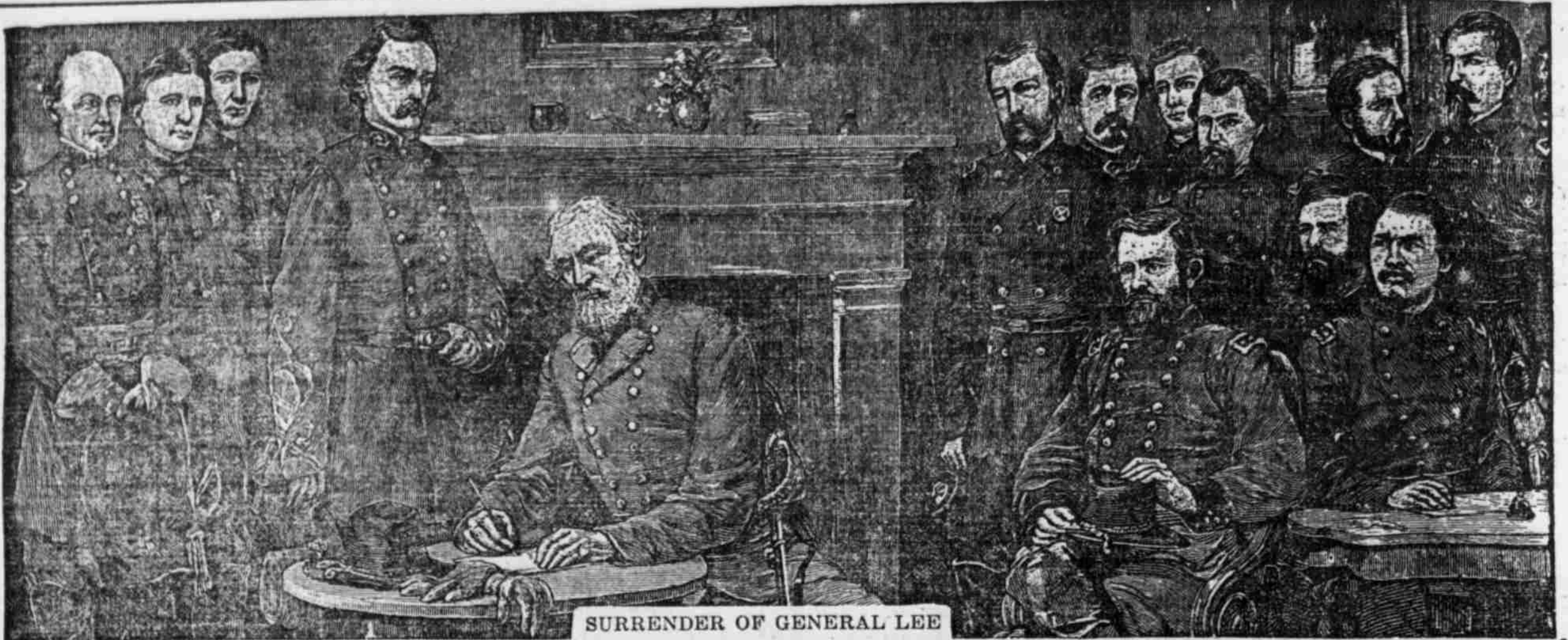
SURRENDER OF GENERAL LEE

The American Civil War was the most stupendous conflict in all the tide of time. More men were engaged on each side than in any other conflict of ancient or modern history. The surrender of General Lee to General Grant at Appomattox is the climax of important events in this mighty struggle. We may rejoice in having lived to see the day when the sons of those brave soldiers have marched shoulder to shoulder in the Spanish-American War, in defense of one flag—one common country. The picture shown here from Ridpath's History is but ONE of TWO THOUSAND in the complete work, and serves to illustrate but ONE EVENT out of all the THOUSANDS which make up the history of every empire, kingdom, principality and nation, all accurately and entertainingly told in the world-famed publication.