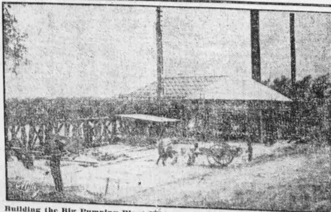
Building the Big Pumping Plant Which Irrigates LaLomita Ranch, Mission.

The LaLomita lands at Mission are in the delta of the Rio Grande, and are rich sediment lands, with an abundance of river water for irrigation; in climate, fertility and products these lands are the equal of the Nile delta in Egypt. In truck growing this land produces earlier vegetables and fruits than any other part of the United States. Even as early as the first of January the Mission truck growers ship to northern markets carloads of cauliflower, cabbage, string beans and peas. Onions grown at Mission net from $200 to $500 per acre. Table grapes ripen two months earlier than in California, are shipped to northern markets early in June, and are also 1,000 miles nearer these markets than the California raised grapes. In sugar cane, especially, the LaLomita lands are superior to any part of the world, producing more cane to the acre and richer juice than any other country. Sugar cane raised in Hidalgo county won the gold medal at St. Louis.