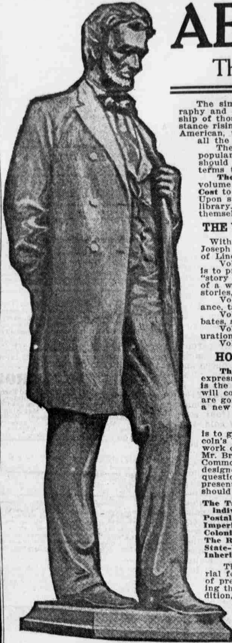
From a Photograph of the portrait Statue by Augustus St. Gaudens, Lincoln Park, Chicago

The Most Interesting American of the Nineteenth Century