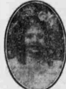
"I got a pony."

We have some beautiful and valuable Shetland ponies and outfits that we propose to give to boys and girls who are wide awake and ready to do us a favor. These are genuine Shetland ponies, stand about 41 inches high, from 3 to 5 years old, well trained and broken, and as gentle as kittens, just the very thing you have been wanting for a long time. These outfits include pony, carriage and harness or saddle and bridle. Beauties, every one of them.