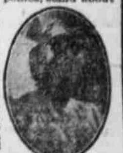
"So did I."