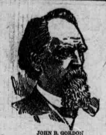
A Partial List of Contributors