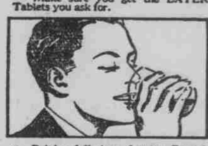
2 Drink a full glass of water. Repeat