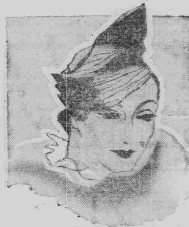
The Peakster 3.95

THERE is a Paris influence over all the new models shown in this Spring Opening presentation of fine Millinery. Maybe that is the reason the younger crowd has turned to them—because they are so smart in style line. There is every new material—every new treatment and combination of materials. They are bright, they are gay and they are priced to fit all pocket books. $1.95 to $5.00.