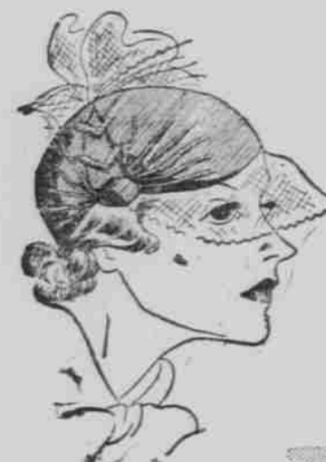
The Parader 2.95