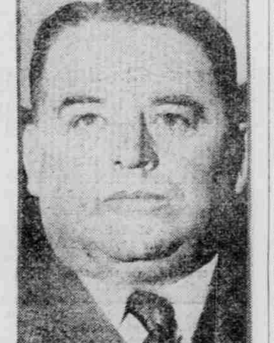
Engineer Who Supervised Construction of New Bridge

After this, the problem of finance g was next in importance. The inwill be made to pay for itself in a omparatively few years, but making castern investors see the matter in