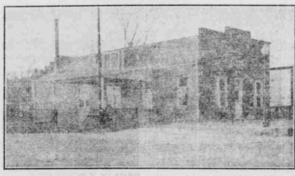
CASS COUNTY FARMERS CO-OPERATIVE CREAMERY

Opening in December, 1928, Sponsored by Chamber of Commerce - Initial Pound of Butter Purchased for $500 and Presented to Governor