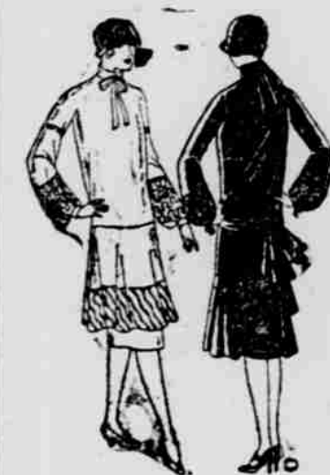
Georgette crepe, flat crepe or printed crepes. For whatever occasion you need a new frock, the style and size is here.