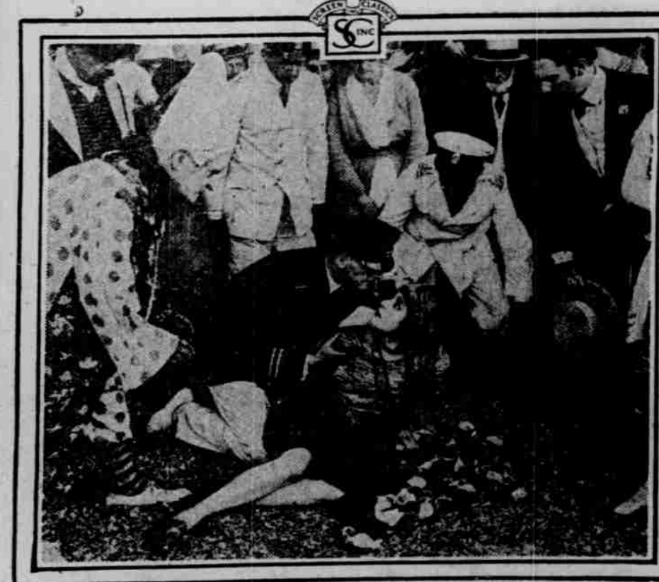
NAZIMOVA in "EYE FOR EYE"