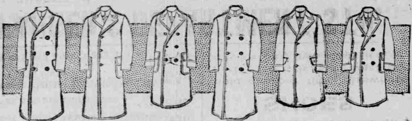
The Arctic The Kenwood The Hyde Park The Academy The Strand The English

SHAWL COLLAR COATS here in chin-chillas of all colors at all prices--we have prepared for the vogue in a thorough way you'll like.