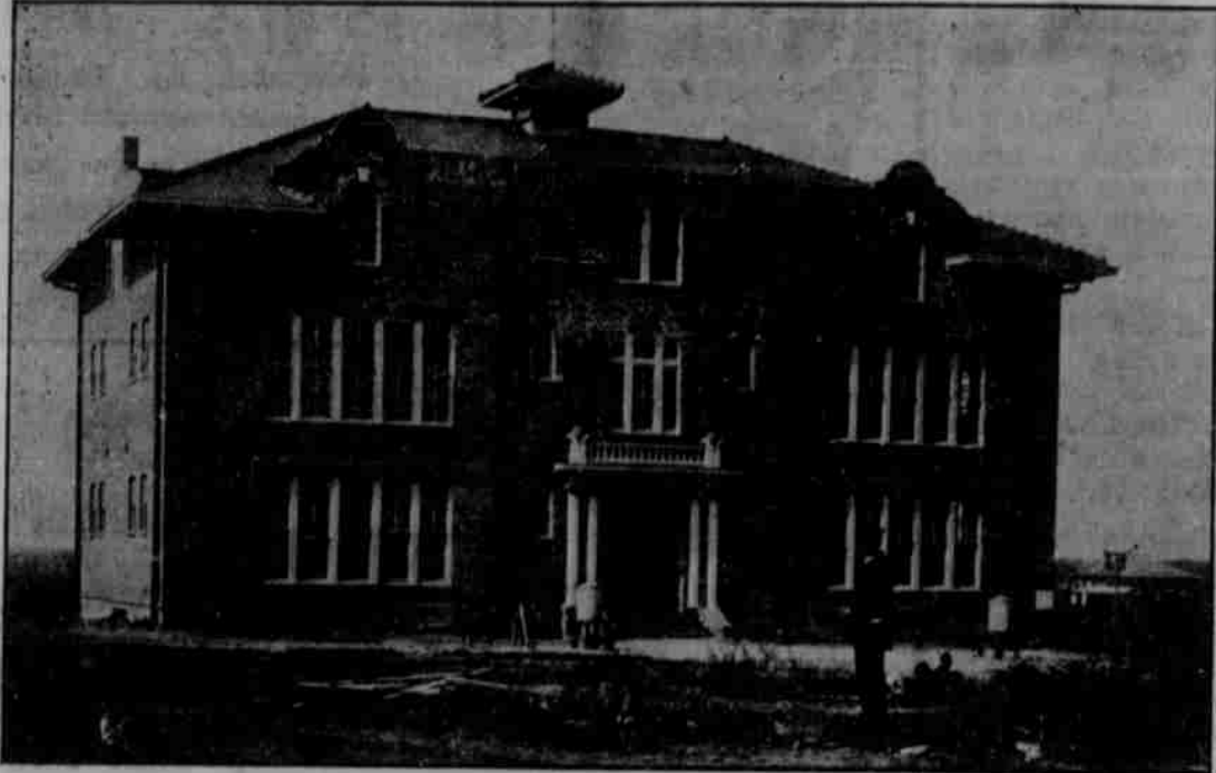
JOURDANTON HIGH SCHOOL