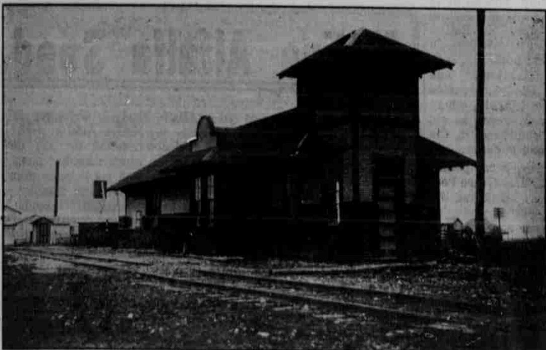
S. A. U. & G. DEPOT

W E INVITE you to come to Jourdanton and invest gate fully. You will be well repaid for the visit.