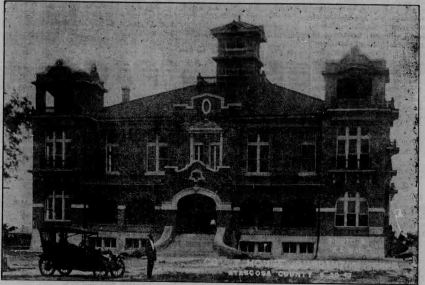
ATASCOSA COUNTY COURT HOUSE AT JOURDANTON

B ELIEVING that there are thousands of men and women in these United States looking for and anxious to take advantage of the opportunities offered at Jourdanton, and being unselfish in the enjoyment of the good things we have is why we are placing this advertisement in the Journal. Aside from the fact that we have faith in this town, and believe in its future and want to see it advance to its predestined place as the largest city in Texas south of San Antonio, we believe it only fair to shed the light of publicity upon its prosperity and manifold advantages.