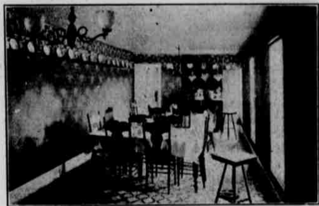
DINING ROOM—ELMWOOD HOUSE

village, and now makes a prepossessing appearance added to the beautiful homes that have since been erected. Manley is situated in the grain belt of Eastern Nebraska, and it is said to be the greatest grain shipping point in Cass county, necessitat-