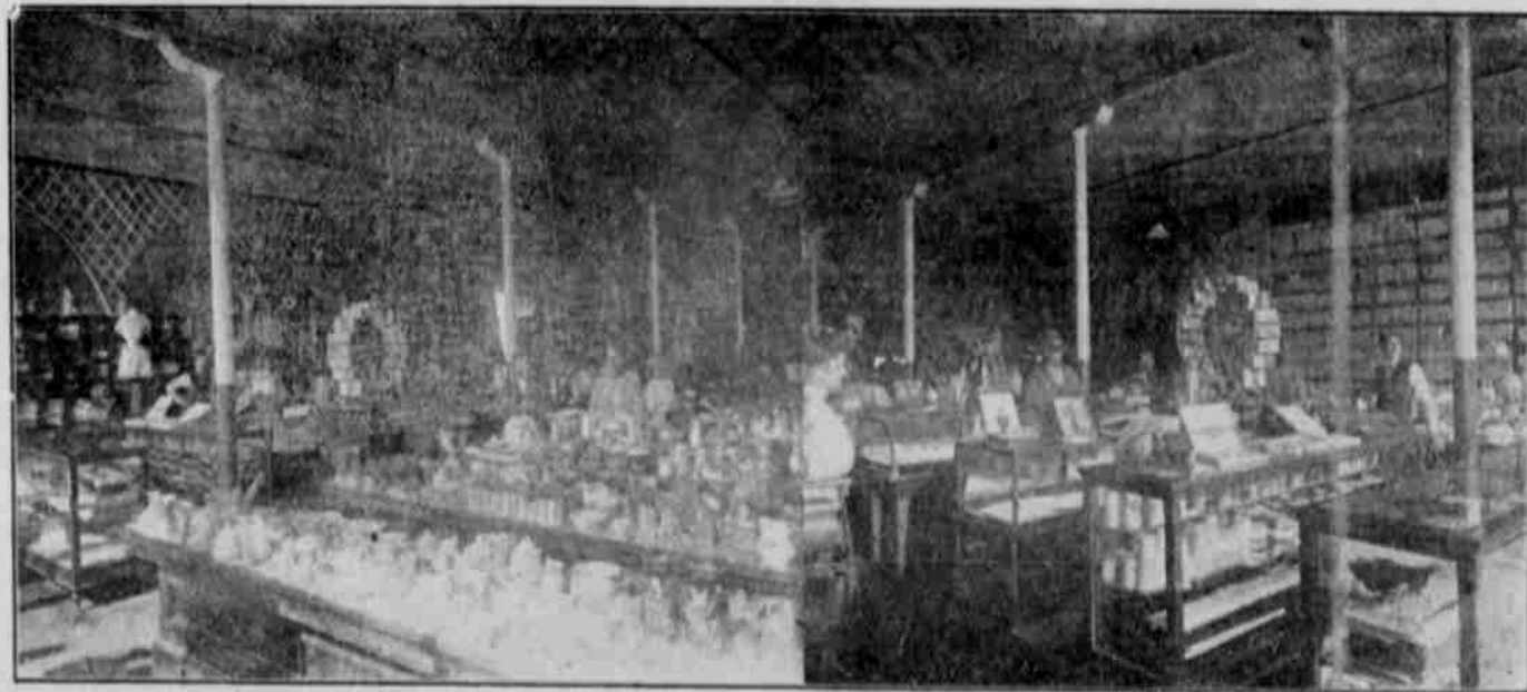
INTERIOR VIEW OF SWARTS & WEICHEL'S STORE

They buy and pay the highest price for all farm products, and in every respect are progressive, wide-