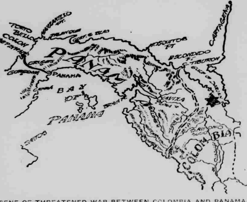
SCENE OF THREATENED WAR BETWEEN COLOMBIA AND PANAMA. (Star marks location of Gulf of Darien, where Colombian troops are said to have been landed to march to Panama.)

COLOMBIA MEANS TO MAKE EFFORT TO COERCE PANAMA