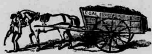
Iron Toys 5c to $2