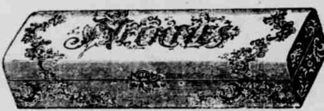
Necktie Cases 50c to $4.00