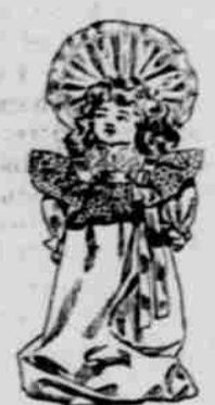
DOLLS For Every Little Girl in Cass County

Handle Voegele & Dinning's Fine Confections.