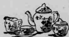
Beautiful line of China and Cut Glass