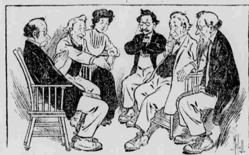
There Were Present All the Wise Men of the Community.

"But you must agree," Mr. Nudge interposed, "that our young men have been inspired with a spirit of unrest." "Yes, I acknowledge that," said Lim. "And a spirit of unrest is the first step toward advancement. The young fellows saw that they needed a better, a more practical education, and they set about to get it. If there is a better teacher than experience it is example."