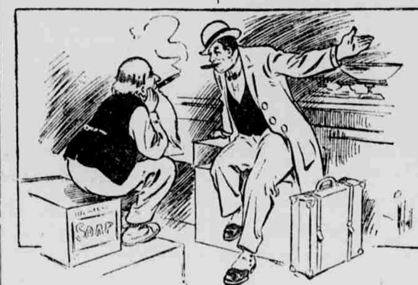
"He Has the Progress of the World Buckled Up in His Sample Case."

"Well, I wouldn't place it below everything. Trade is the exchange of materialized ideas. It is the circulating blood of a nation. Art is a sort of fever and marks disease. Literature is a prescription, and if it don't help life fails to do it any good. I want to tell you, a drummer first set me to readin'. Of course I knew what books were. But I thought that when a man got along well in life he ought to think of everything except books. They were for boys and girls. But this drummer that stayed all night at my house said that the greatest books had been written by old men. Therefore they ought to be read by old men. He opened up a new view of life. He showed me that as long as a man lived and kept his health he could develop and expand. He left a book