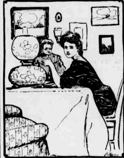
Was Just Sixteen When He First Came to See Me.

about me. He says that he must go away next week, and shall die if he can't see me once more. What ails him, anyway?"