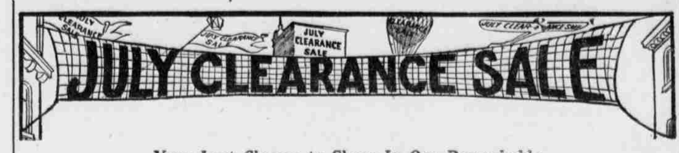
Your Last Chance to Share In Our Remarkable