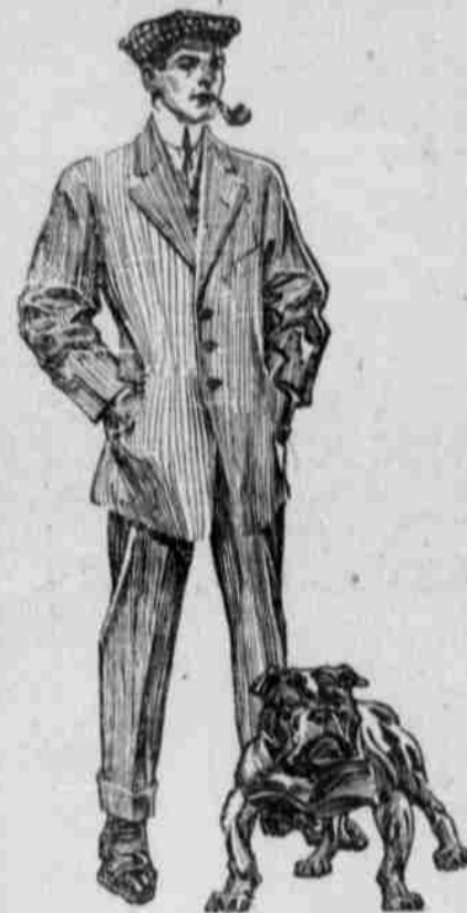
Copyright 1910 The House of Kuppenheimer Chicago

MEN who pride themselves on their ability to select and wear good Clothes—Correct Clothes—many now have the pleasure of seeing the choicest Models and the newest fabrics for Fall wear if they will call "Just for a Look".