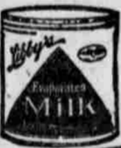
Libby, McNeill & Libby Chicago

Use Libby's and tell your friends how good it is.