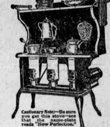
Cautionary Note—Be sure you get this stove—see that the name-plate reads "New Perfection."

What a contrast! The kitchen no longer is stifling hot, the work is now done with comfort, and the housewife is not worn out with the heat.