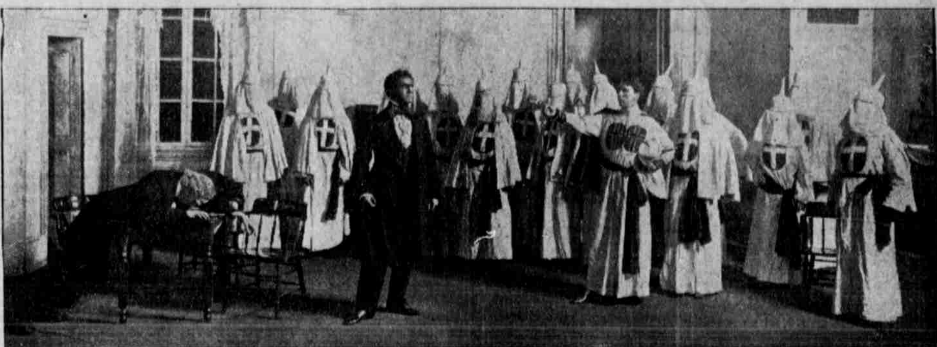
Scene from "The Clansman", to be presented at The Keith Thursday Evening, February 17th.