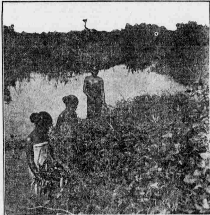
Filipino girls picking edible plants in a branch of the Pasig river near Manila.