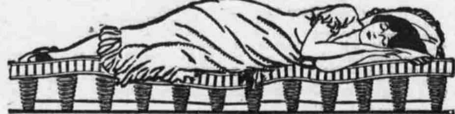
"It's the BEDSPRING, not the bed or mattress that makes all the difference."

DeLuxe is handsomely finished in Rome Gray Enamel and will fit metal or wood beds (and bow-foot wood beds) without any change.