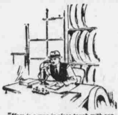
"Here is a man in close touch with one of the 92 U. S. Factory Branches"