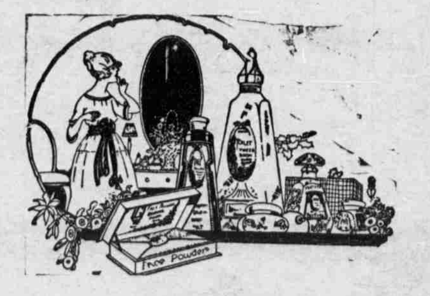
at this store you will find gifts suitable For All The Family

Dalion Phonographs (prices now reduced); Cigars, Fountain Pens (Scheaffer and Waterman) Johnston's Candies and Chocolates, Fine Stationery, Pocket Books, Cameras, Photo Albums, Manicure and Ivory (in sets or separate) Perfumes, Books, Dolls, Teddy Bears, Etc.