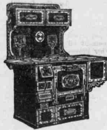
Monarch Malleable Iron Ranges