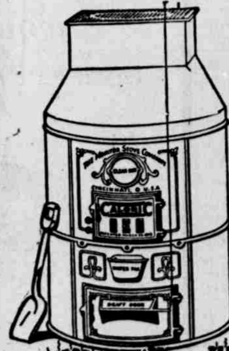
THE ORIGINAL PIPELESS FURNACE TRIPLE-CASING PATENT

Heats frames like the Sun heats the Earth.