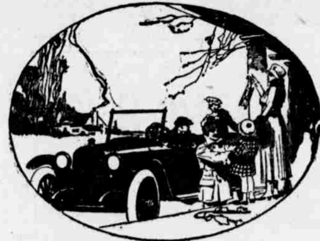
The Comfort Car

When we speak of comfort, you naturally think first of bodily comfort. There is comfort also in knowing that your Hupmobile conserves gasoline by making every gallon go farther. It actually does increase gasoline mileage by no less than 24 per cent.