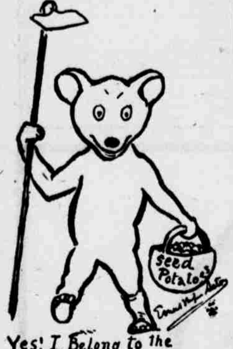
Yes! I Belong to the Woodcraft League & Im going to do my bit.

Next to wheat the potato is our most important crop. It can be raised on small plots; it can be cared for by the average person. Ernest Thompson Seton says: "The largest addition to will rival squad, and teams will work