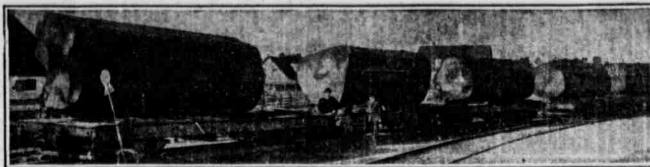
Train Load of Redwood Logs at Factory of the Atlas Mfg. Co.