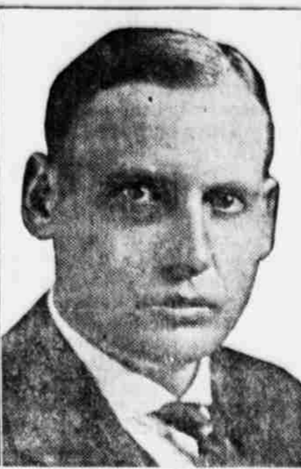
HE'S FROM "OUT WEST."