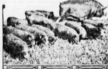
Well-Developed Sow With Profitable Litter.

"If you have studied hog conditions in the United States you will find that about four pigs per litter is the average; and I can point to you men in Arizona who are actually raising for market two and three pigs to the lit-