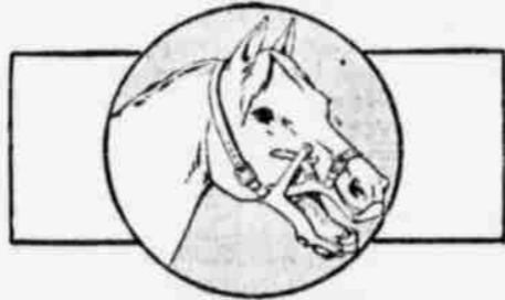
Holding Horse's Mouth Open.

Two pairs of pivoted jaws are equipped with teeth plates to cover the teeth of a horse. One of the jaws terminates in a set of fixed teeth, which may become engaged with a