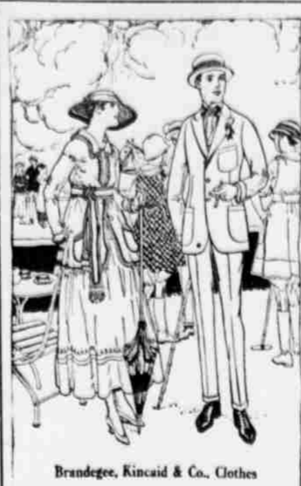
Brandegee, Kincaid & Co., Clothes

It is an important function of live stock on the farm to furnish a market for the crops grown, enabling farmers to convert the grasses, forage crops, legumes, and so on, into higher-priced finished products and to return to the soil the plant food taken from it.