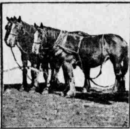
Serviceable on Any Farm.

Improvement in the horse stock of this country has never been offered greater opportunities than now. The surplus of common horses, fit for use have been bought and shipped out, leaving the best and the poorest in quality. Horse owners have had the apportunity to sell those they did not care to keep for use on the farm. It is now up to the owners of breeding stock to breed to the best sires in