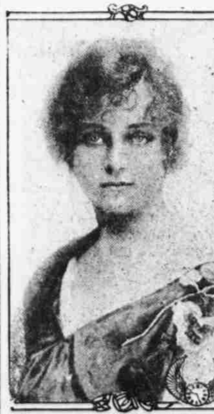
FLORENCE LABADIE, "THE PRICE OF HER SILENCE" FOUR-ACT MUTUAL MASTERPIECE MADE BY THRUWATER