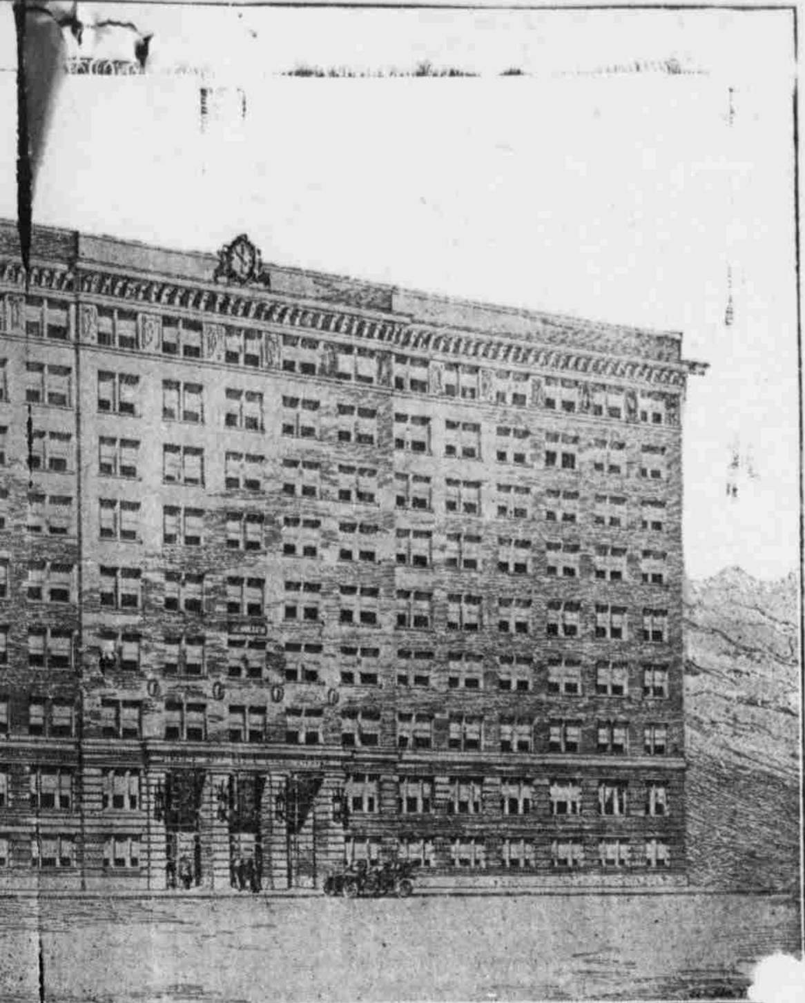
EXCHANGE—LARGEST IN THE WORLD