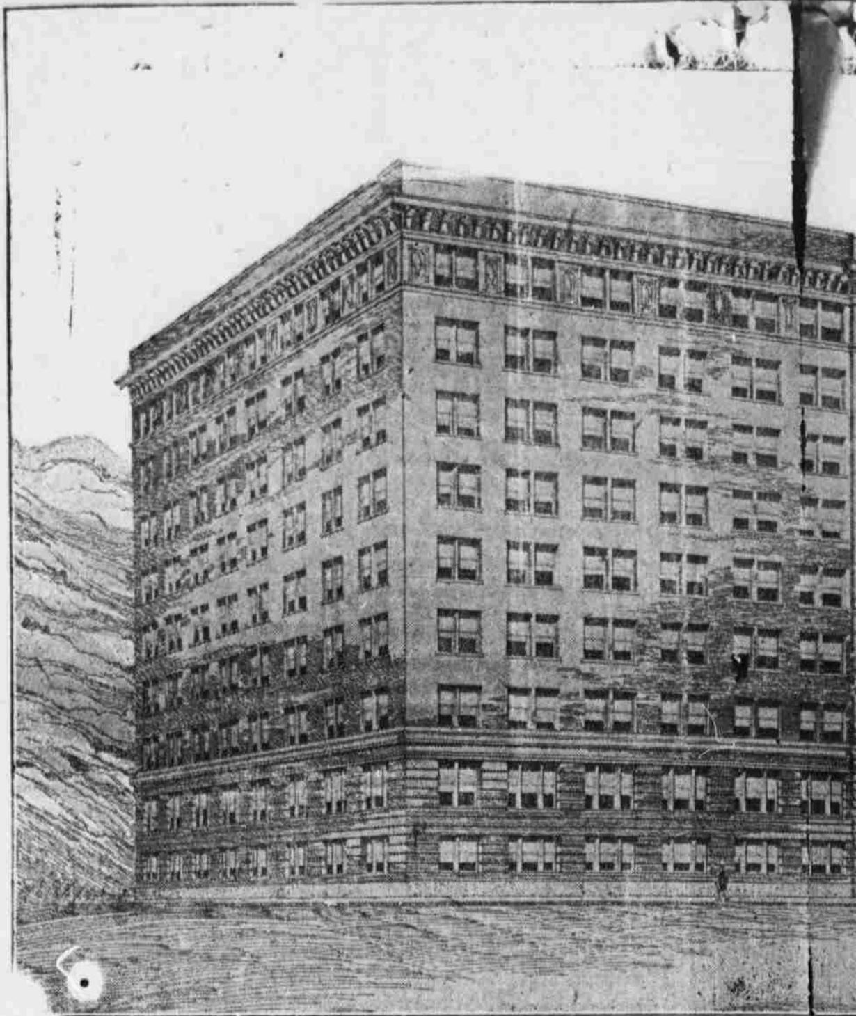
KANSAS CITY LIVE STOCK EXCHANGE