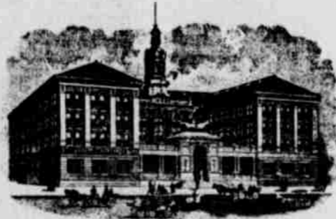
Exchange Building South St. Joseph, Missouri

St. Joseph is a city of 90,000; is located on the Missouri river, 65 miles north of Kansas City, Mo., 140 miles south of Omaha, Neb., 225 miles due west of the Mississippi river from Hannibal, Mo., and is served by the following railroads: A. T. & S. F. (Santa e System); C. B. & Q. R. R. (Burlington System); C. R. I. & P. lock Island System); Chicago Great Western; Missouri Pacific; J. & G. I. (Union Pacific System)—direct connection is afforded by these lines with all principal railroads, both in the east and west, so that patrons and live stock are not inconvenienced in travels to or from St. Joseph. Ample and up to date hotel facilities.