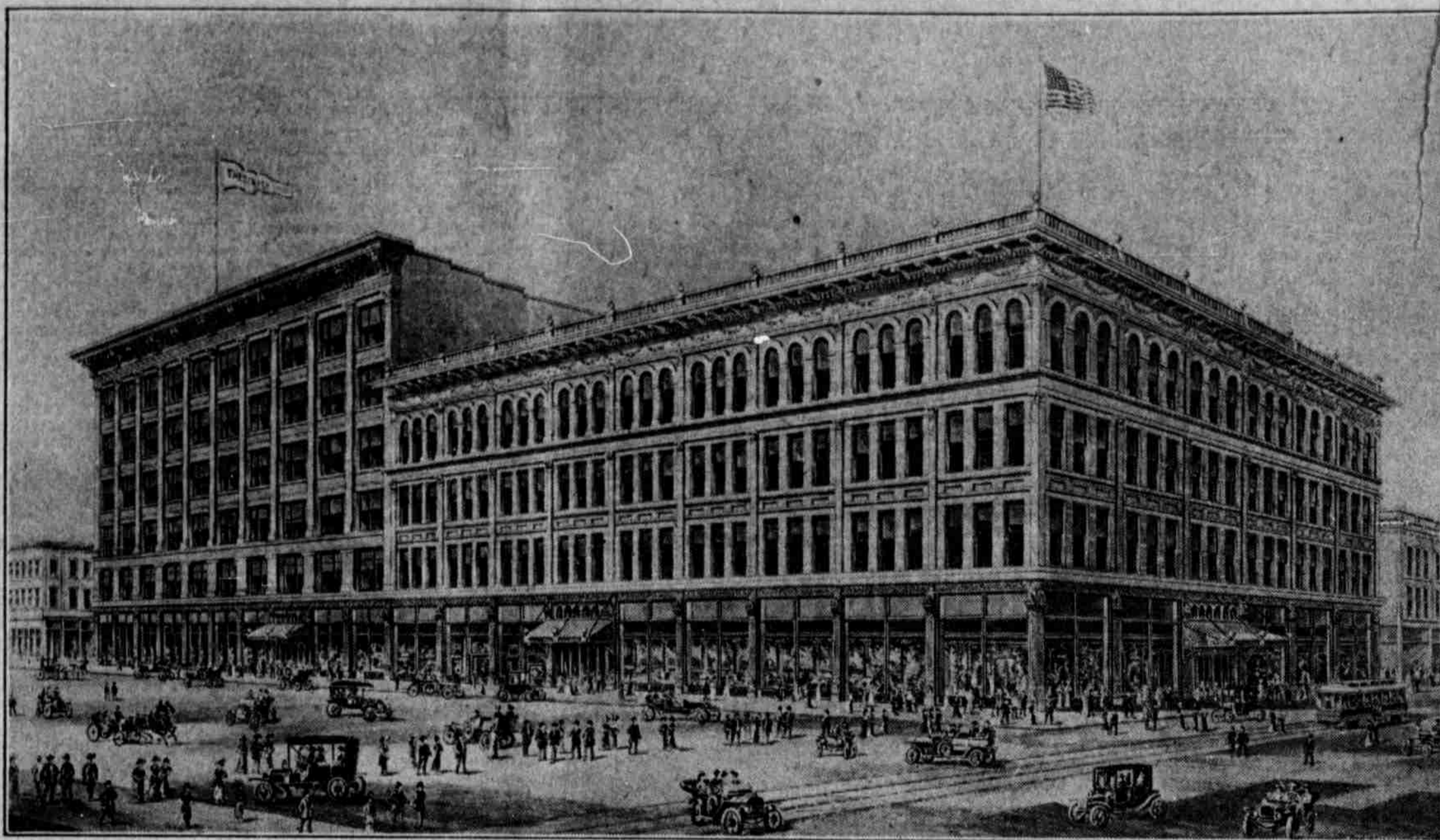
BUILDING OF THE DENVER DRY GOODS CO.—400 FEET LONG

"THE DENVER" IS DECIDEDLY THE LARGEST STORE IN THE CENTRAL WEST, CARRYING THE LARGEST STOCKS OF EVERYTHING WORN BY MAN, WOMAN, MISS, BOY, CHILD OR INFANT, AND EVERYTHING FOR HOUSEHOLD USE OR ORNAMENT PREPAID TO YOUR NEAREST POST OFFICE OR STATION, excepting in such heavy merchandise as Furniture, etc. THIS HAS BEEN MADE THE LARGEST WESTERN STORE THROUGH ITS CONSTANT ENDEAVOR TO BE THE BEST WESTERN STORE—NEVER FORGETTING ITS CHANGELESS MOTTO OF "ABSOLUTE RELIABILITY"