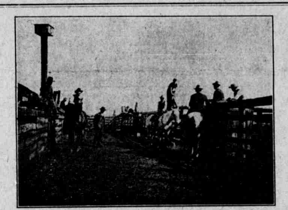
Early Morning Scene in Denver Union Stock Yards—Ready to Begin Buying and Selling

tket grow from a small beginning its present large proportion. The iness in the last eleven years has re than quadrupled. While he is y modest about claiming any dit for the success that is being.