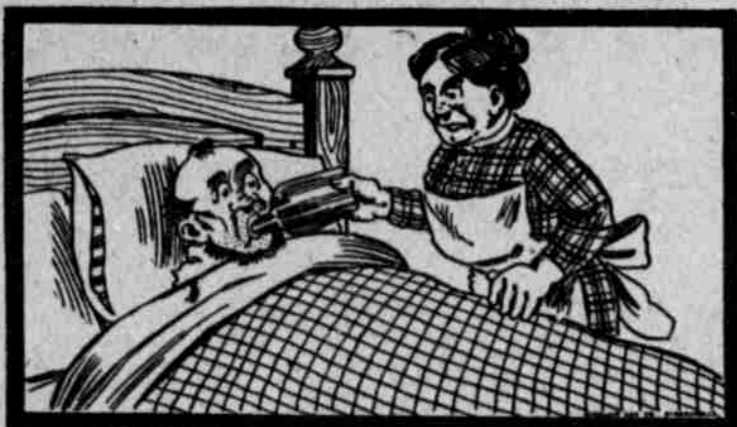
THE SALES WE MAKE ARE NOT BAD MEDICINE TO TAKE

"About the only business that runs itself is the one that's running down hill."