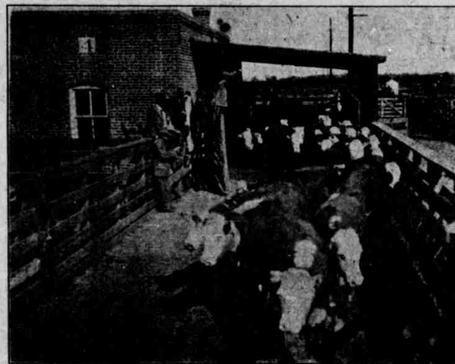
Weighing Them Up at the Denver Union Stock Yards. Western Ranch Cattle Crossing the Scales En Route to the Packers' Killing Pens

Union Stock Yards, Denver, Colo. Phone Main 7398