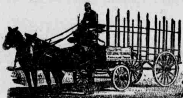
Dray Phone 54 Residence phone 636 and Blue 57

for Saturday Candy Specials Sugar Bowl Candy Kitchen