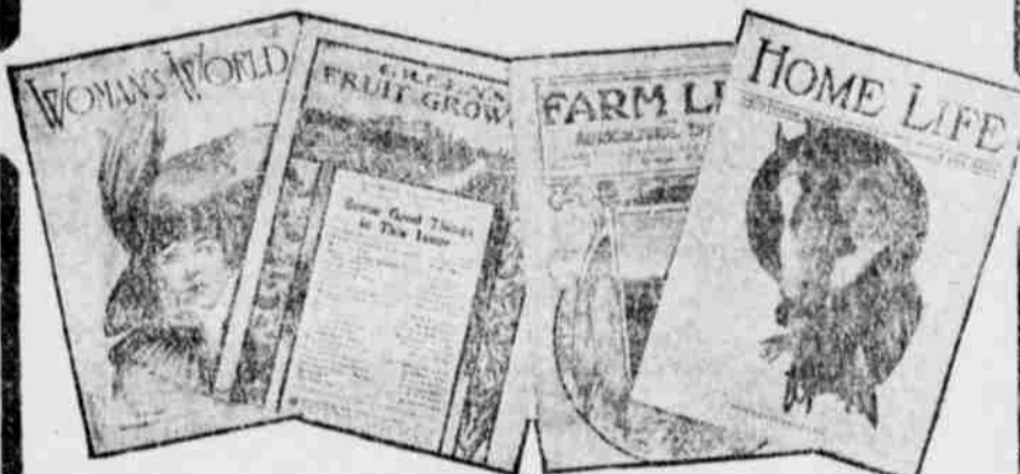
Woman's World, 35c yr. Green's Fruit Grower, 50c yr. Farm Life, 25c yr. Home Life, 25c yr.

$1.68 This Is Our Best Offer $1.68 These Four First-Class Magazines and Our Paper, ALL FIVE ONE YEAR, ONLY