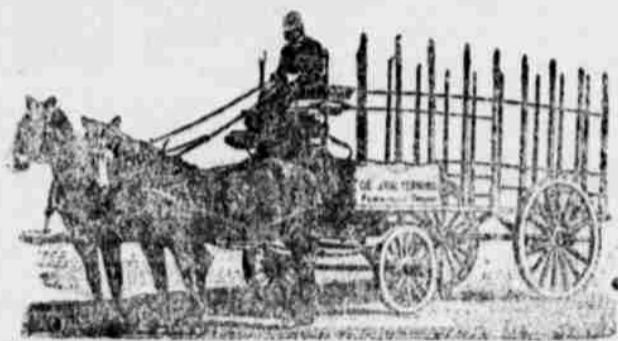
Dray Phone 54

$1.68 JUST THINK WHAT IT MEANS! $1.68 Our Paper and These Four Standard Magazines ALL FIVE ONE YEAR, ONLY