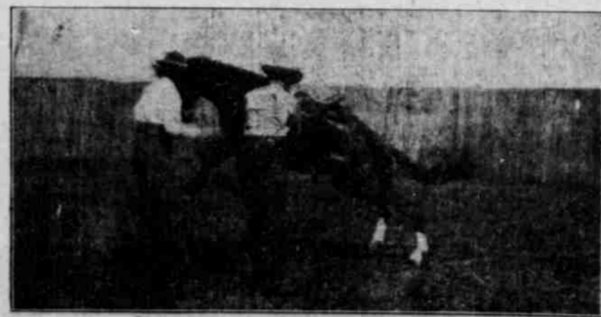
Saddling a Bucking Bronco