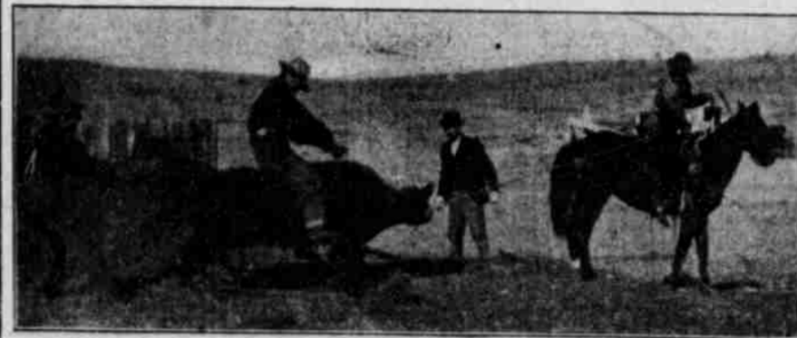
Riding a Wild Steer