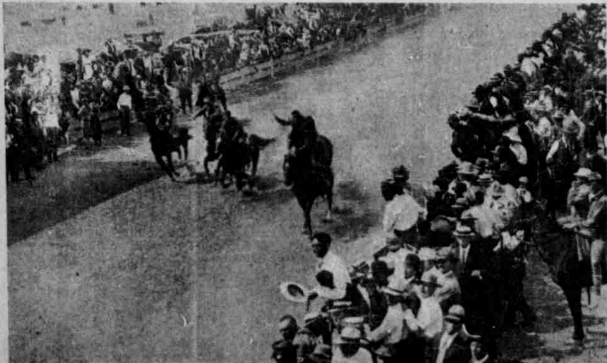
Finish of an Exciting Race at Fair Grounds

Hundreds of dollars are being offered as prizes in the races and contests. You will have the time of your life. Prices for admission to Fair Grounds, 50c; to grand stand, 10c; children 8 to 12, half price; children under 8, free